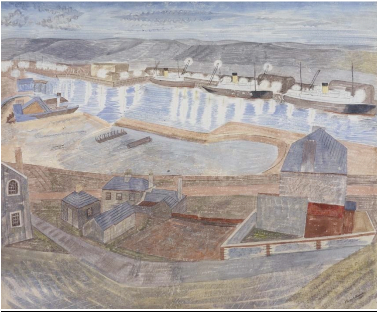
Edward Bawden September 8.30 pm (Newhaven) 1936 Watercolour on paper 46.5 x 58.5

The Gallery were particularly anxious to acquire this painting because Edward Bawden was a close friend of Eric Ravilious and they only have one other Bawden in the Towner Collection. In the circumstances, the Friends were very pleased to have the opportunity to assist them in this purchase.