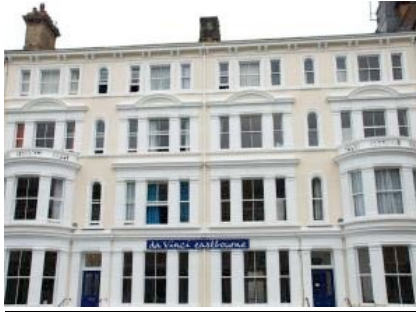
The Da Vinci Hotel

Because the new Gallery is not available we have decided to move this annual event to the Da Vinci Hotel in Howard Square and we are grateful to the hotel for agreeing to this. It will start at 11am and will be an opportunity for people to renew their subscriptions and book for some future events. It is not necessary to book for this event in advance.