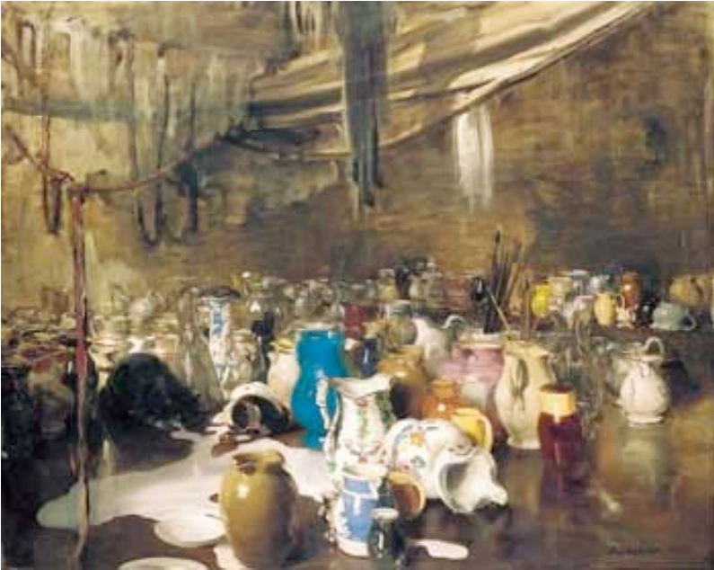
100 Jugs 1916