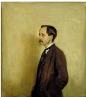
Sir James Barry