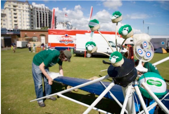
Work in progress on the Wish Tower slopes

During the four days of Airborne this year the artist David Kefford created a site specific sculpture on the Wish Tower slopes. During the air show visitors were invited not to bin their rubbish but to drop off their cans, water bottles and cardboard at the art sculpture point. David used a discarded tail unit from an aircraft and built around it the discarded items, bound together with packaging tape, cable ties and cord. The parts of the plane became virtually unrecognisable by the end of the four days and an interesting contemporary sculpture was produced.