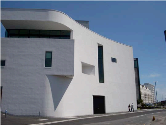
The new Towner - Side View