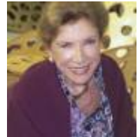
Guests arriving and mingling in the foyer