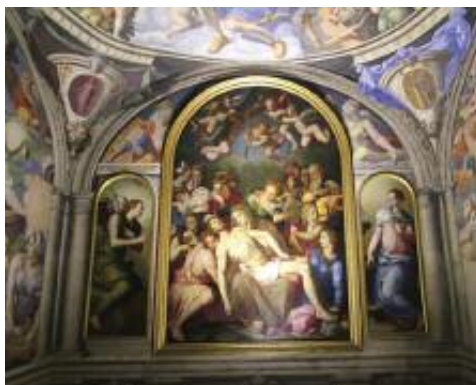
Inside the Vecchio Museum, Florence

Not all tour operators include the Uffuzzi in their excursions to Florence because it costs 15 euro per person to buy advance tickets (£13.60). So if you are visiting Italy and are keen to visit the Uffuzzi Museum it is essential to check if it's included in your excursion package.