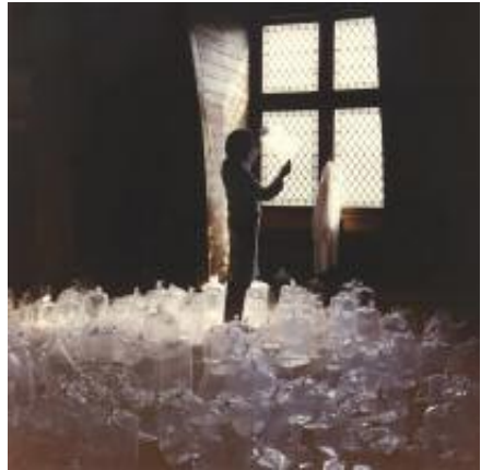
Tacita Dean, Bag of Air

For more information on the New Eyes display or Bluemonkeynet artist network visit Towner's website – www.townereastbourne.org.uk