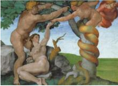
The Original Sin, Michelangelo Sistine Chapel

You need to go to the Vatican Museum about half a mile away from St Peter's. Again, there is a long line to join for those who do not have advance tickets.