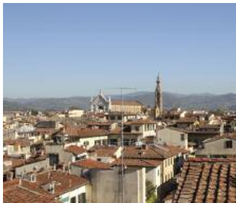
Roof top views over Florence

Unfortunately many people want to see these paintings and the Uffuzzi Gallery has set up a system of two queues: those who have purchased advance tickets who can go straight in and those who turn up on the day, joining a queue which never seems to move!