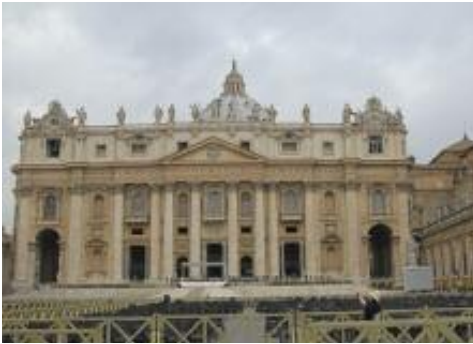
St Peter's Square