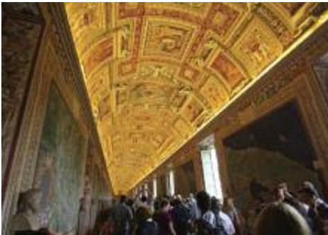
Ceiling detail, The Vatican Museum

It's free to enter St Peter's Church there are long queues, even off-season. This does not include visiting the Sistine Chapel, where the best paintings are.