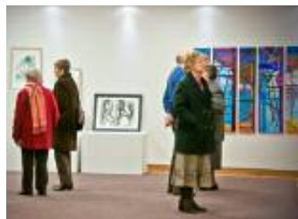
Viewers before the recital