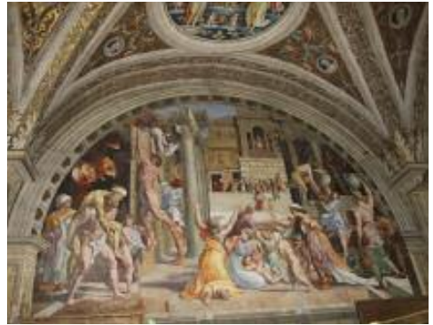
Inside the Vatican Museum

You need to go to the Vatican Museum about half a mile away from St Peter's. Again, there is a long line to join for those who do not have advance tickets.