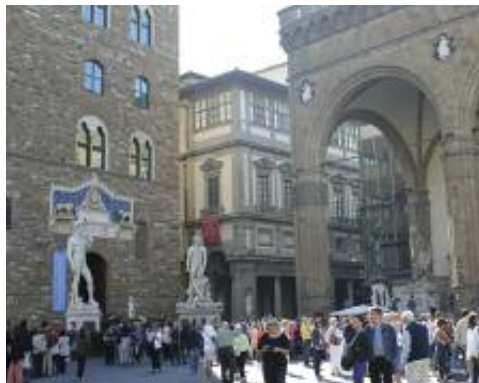
David (copy of original statue) outside Vecchio Museum, Florence

In Florence, there are many museums/galleries including the Uffuzzi Art Gallery which has a number of very valuable paintings including those by Leonardo da Vinci, Tintoretto and Botticelli. Many of the other museums in Florence also have wonderful paintings by these artists.