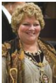
The Mayor Carolyn Heaps