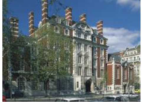
The Royal Academy of Music

This outing is now in its 11th year, and is perhaps among Eastbourne's most popular events. A comfortable 60 seater modern bus will whisk everyone up to London, where lunch is taken in the Academy, followed by two hours of superb singing by young talented classical singers. The first prize is £12,000 the 2nd £7,000 and the Webb Award for the best accompanist is £3,500.