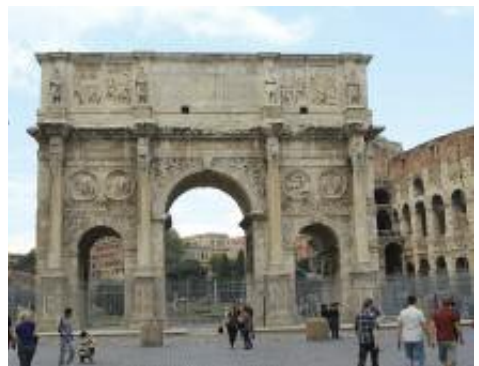
Above photos: The Coliseum, Rome

It's free to enter St Peter's Church there are long queues, even off-season. This does not include visiting the Sistine Chapel, where the best paintings are.